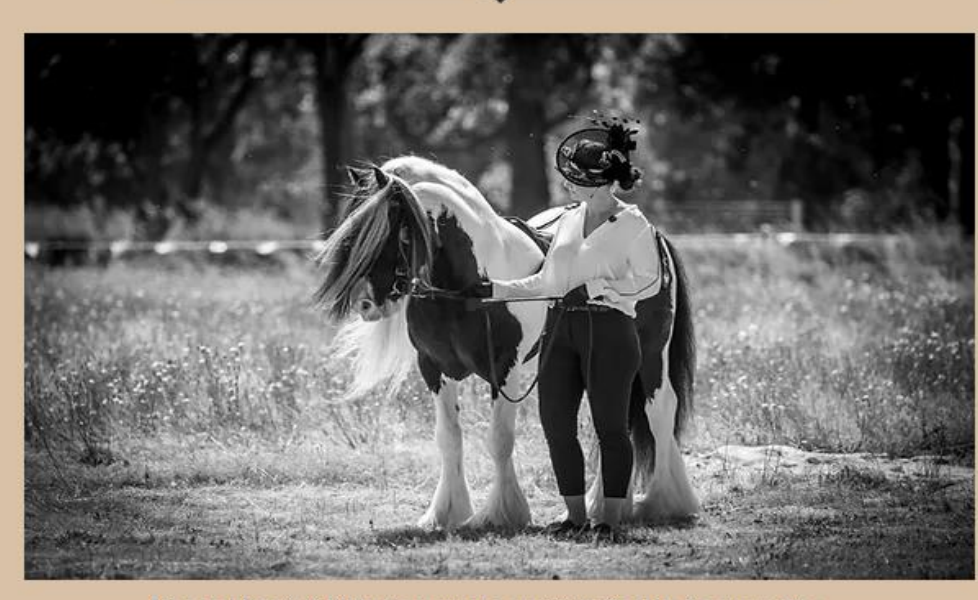
Minstrel (Imp) & Kelly Grey